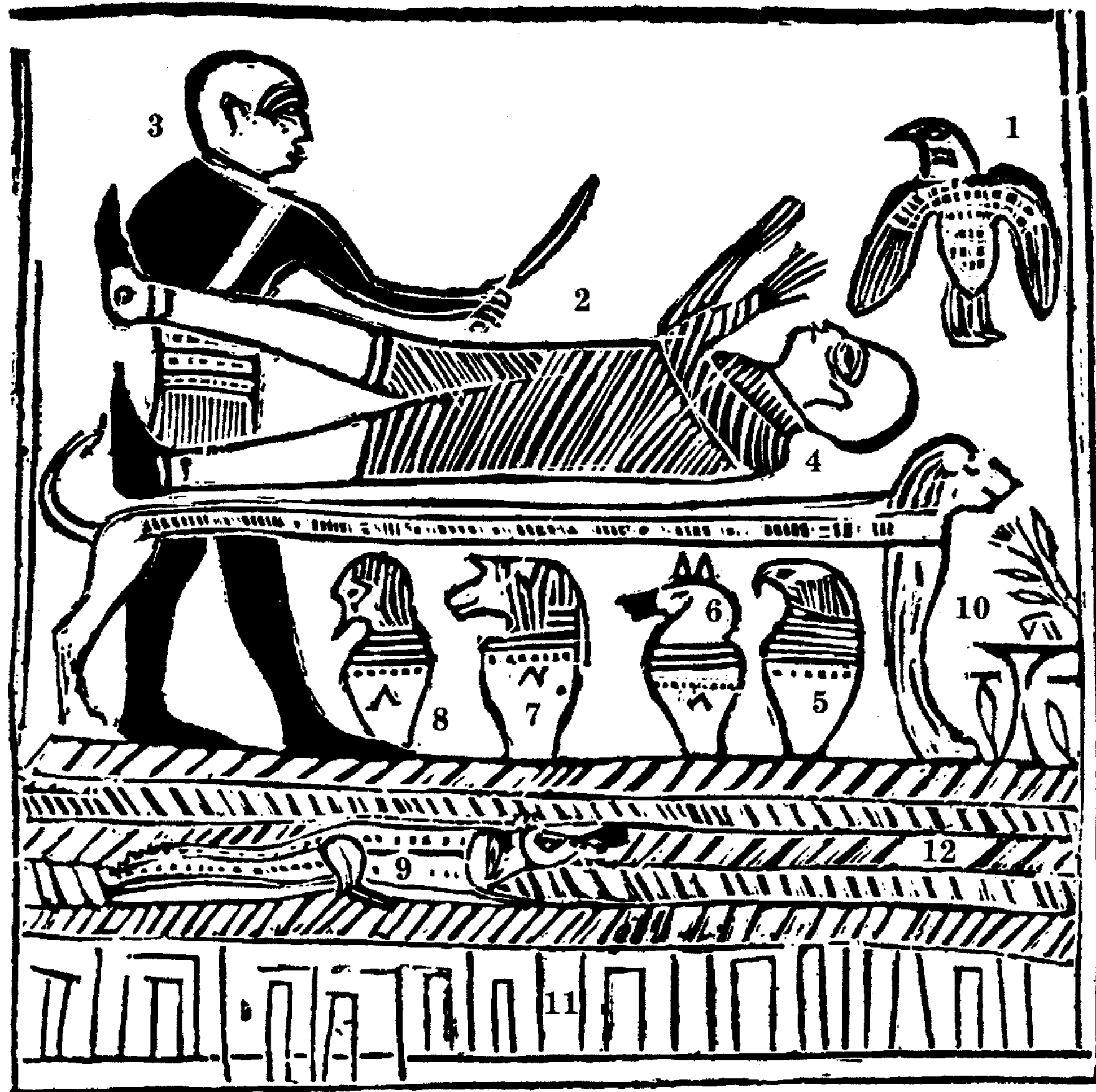
Abraham Commanded by God to Sacrifice Isaac

things, that God did a tempt Abraham, and said unto him, Abraham: and he said, Behold, here I am .