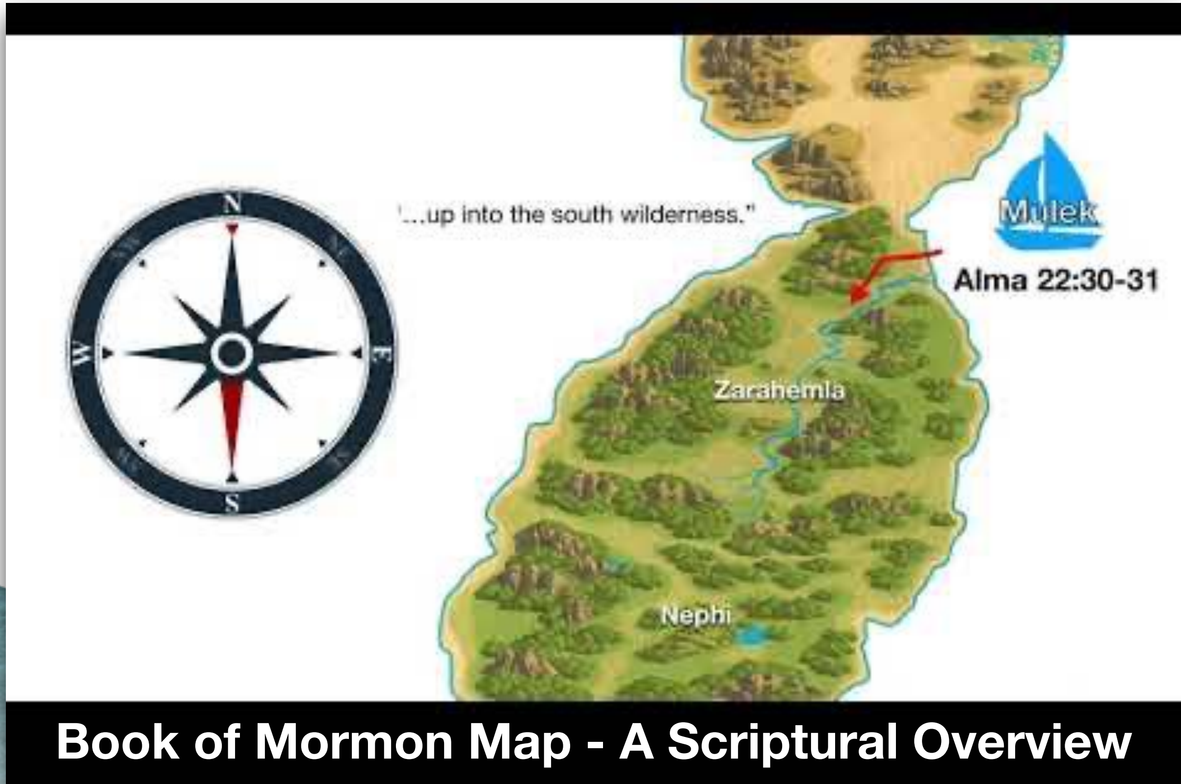
Book of Mormon Map - A Scriptural Overview