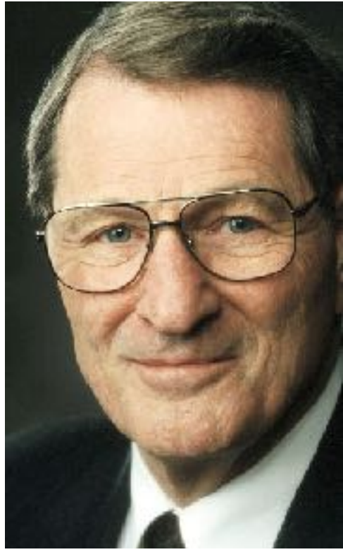
Elder Neal A. Maxwell (1926–2004) of the Quorum of the Twelve Apostles

“God is not only there in the mildest expressions of His presence, but also in those seemingly harsh expressions. For example, when truth ‘cutteth ... to the very center’ (1 Nephi 16:2), this may signal that spiritual surgery is underway, painfully severing pride from the soul”